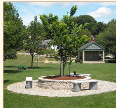
LIBERTY TREE MEMORIAL - DERRY, NH

ALABAMA ARKANSAS ARIZONA CALIFORNIA COLORADO DISTRICT OF COLUMBIA DELAWARE FLORIDA GEORGIA IOWA IDAHO ILLINOIS INDIANA KANSAS KENTUCKY LOUISIANA MASSACHUSETTS MARYLAND MAINE MICHIGAN MINNESOTA