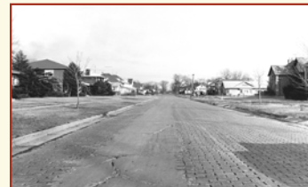
"ELM STREET" AFTER DUTCH ELM DISEASE