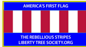
THE REBELLIOUS STRIPES PIN

The "Liberty Tree" Society, sponsored by Elm Research Institute, is an organization dedicated to the celebration of the "Liberty Tree". The story of the "Liberty Tree" is the story of America's first Declaration of Independence.