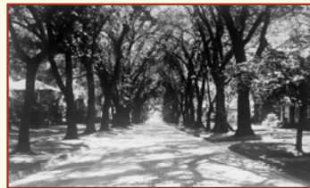
"ELM STREET" BEFORE DUTCH ELM DISEASE

Your "Liberty Tree" Society membership includes an American Liberty Elm. Also, you are entitled to purchase other Liberty Elms - AT COST - to continue "Re-Elming" America.